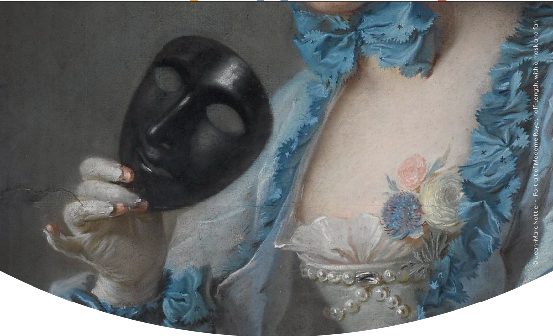
© Jean-Marc Nattier - Portrait of Madame Royer, half-length, with a mask and fan

International Conference Athens 2024 17 th June 2024 9h ~ 19h30